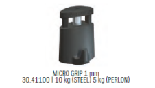
MICRO GRIP 1 mm 30.41100 110 kg (STEEL) 5 kg (PERLON)